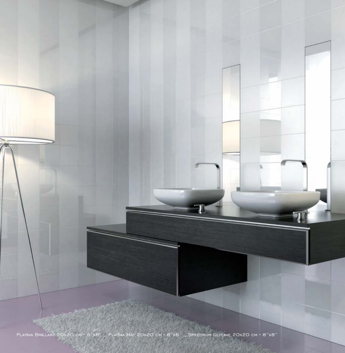
PLATINA BRILLANT 20x20 cm - 8"x8" — PLATINA MAT 20x20 cm - 8"x8" — SPECTRUM GLYCINE 20x20 cm - 8"x8"

Novoceram sas - ZI Orti, Laveyron - BP 20 26241 Saint Vallier sur Rhône Cedex - France Tel. +33 (0) 4 75 23 50 23 - Fax +33 (0) 4 75 23 32 99 www.novoceram.fr - contact@novoceram.fr