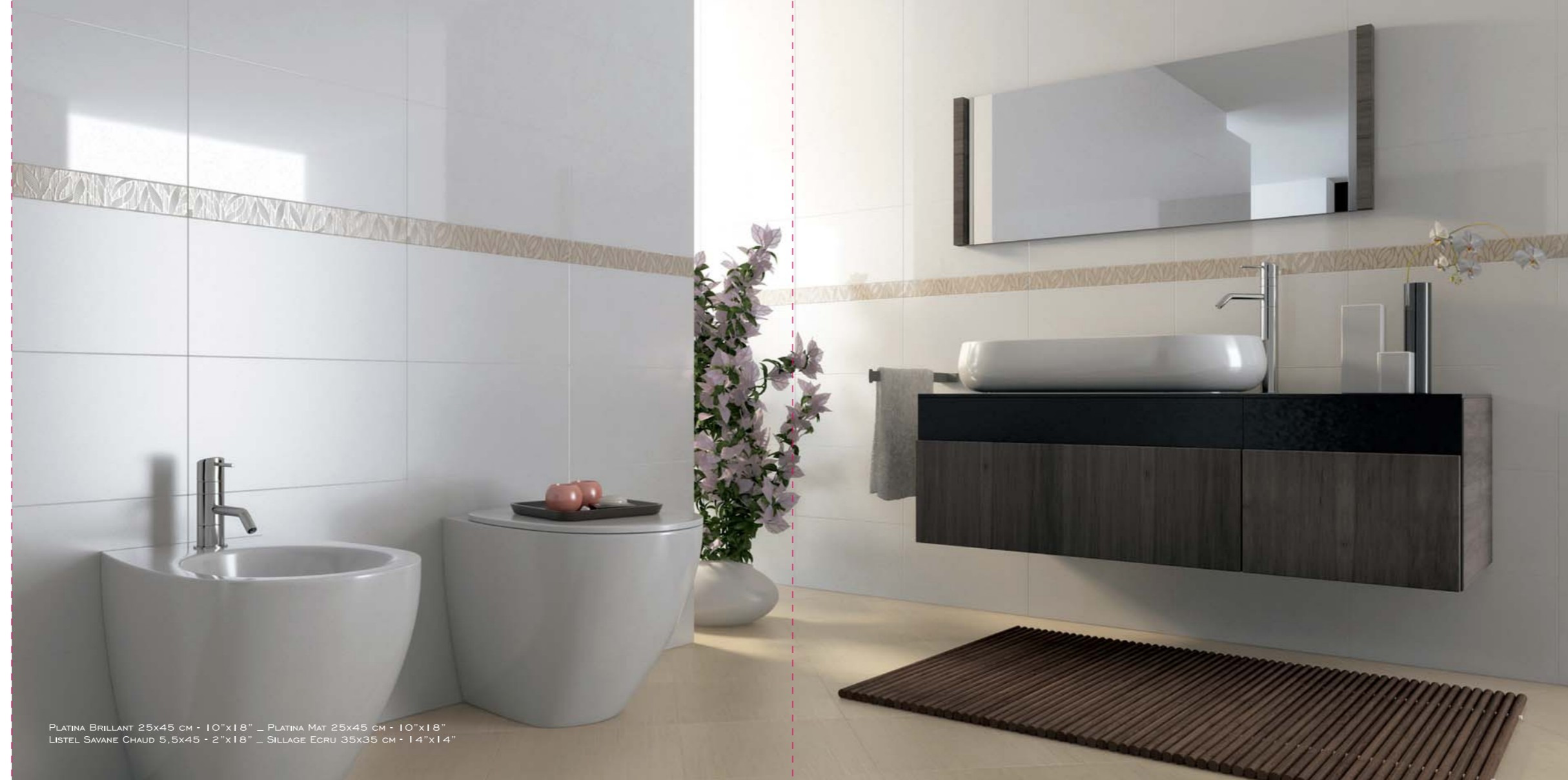
PLATINA BRILLANT 25x45 cm - 10"x18" _ PLATINA MAT 25x45 cm - 10"x18" LISTEL SAVANE CHAUD 5,5x45 - 2"x18" _ SILLAGE ECRU 35x35 cm - 14"x14"