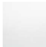
E000 - PLATINA BRILLANT 20x20 cm - 8"x8"